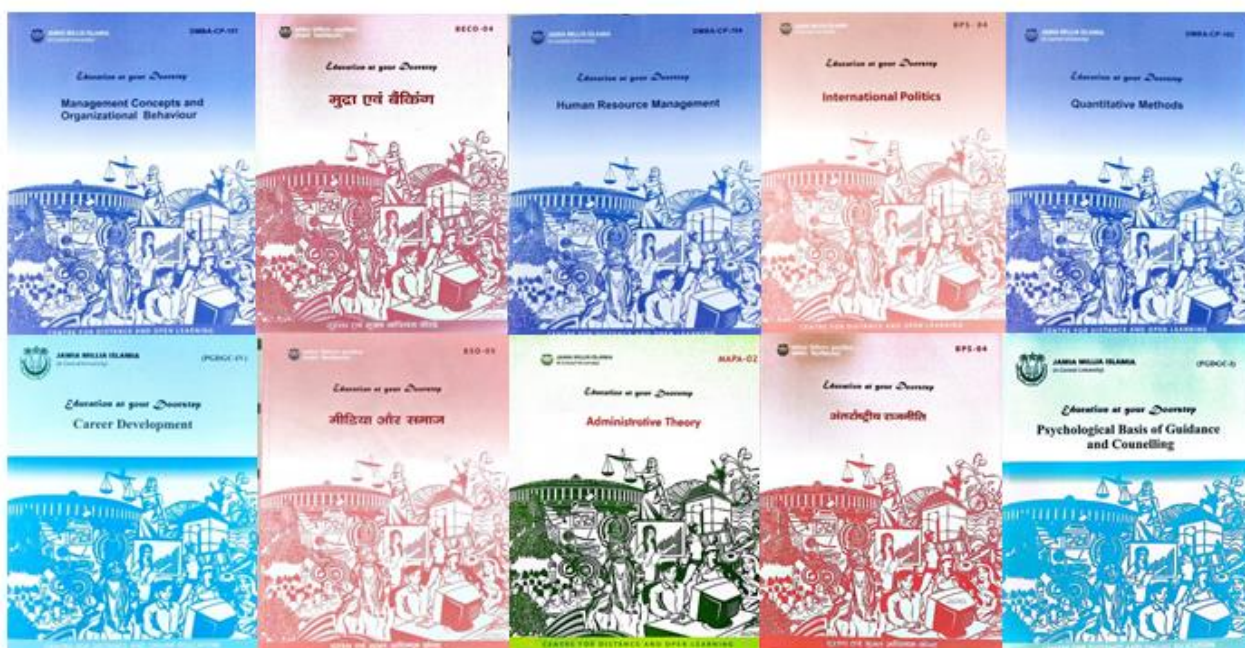
Glimpses of Self-Learning Materials Prepared for Various Programmes

The e-copy (soft copy) of Self Learning Material for both theory and practical components for each programme of study is provided to all the learners of ODL as well as OL mode. The PDFs of the SLM are uploaded to the Google Classroom of each respective programme. The SLM of each course/paper in each programme is prepared in the form of blocks and units. Normally each course is divided into 3 – 5 blocks and each block contains 3 – 5 units. The code for each course under each programme is different so that it may be identified and accessed comfortably.