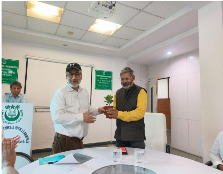
CDOE's staff meeting with the COE.