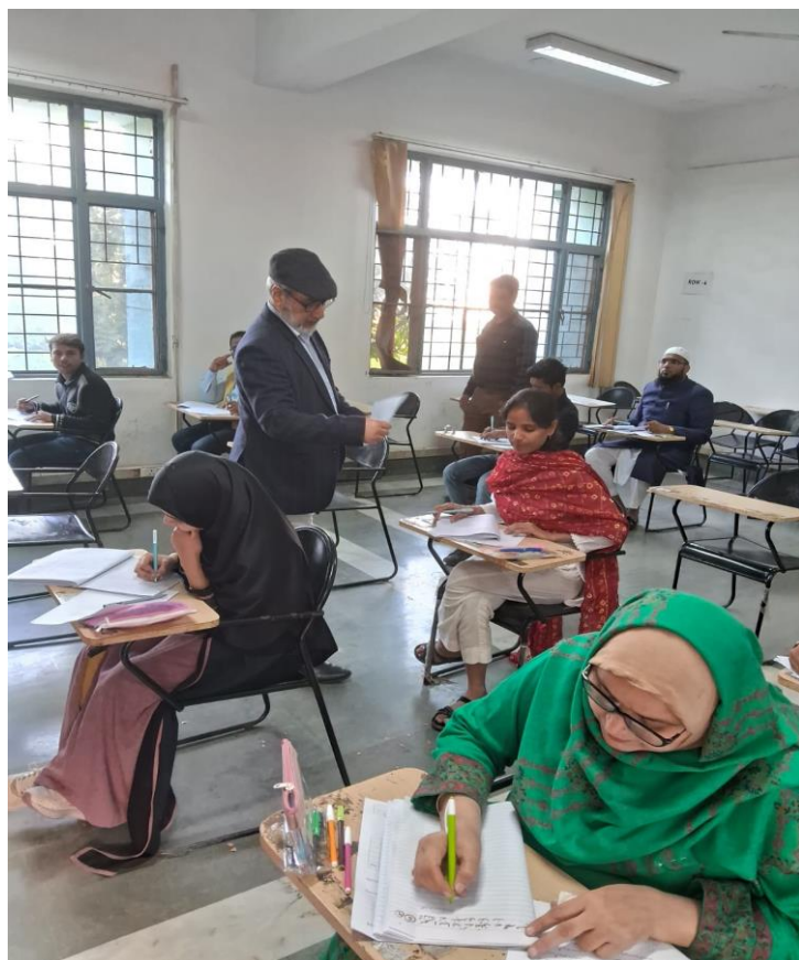
Dean's visit of Examination Centre