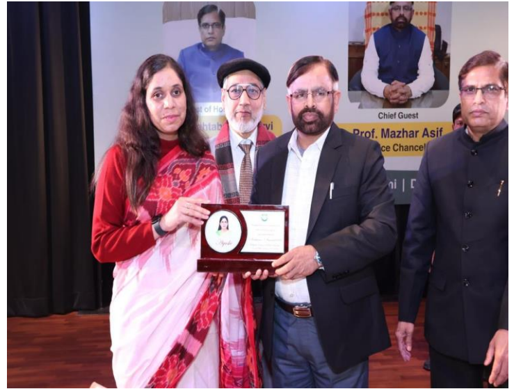
Students' Induction and Felicitation Programme was organized for the CDOE's students.