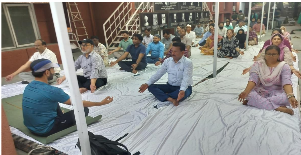
Yoga Day was celebrated at CDOE, JMI