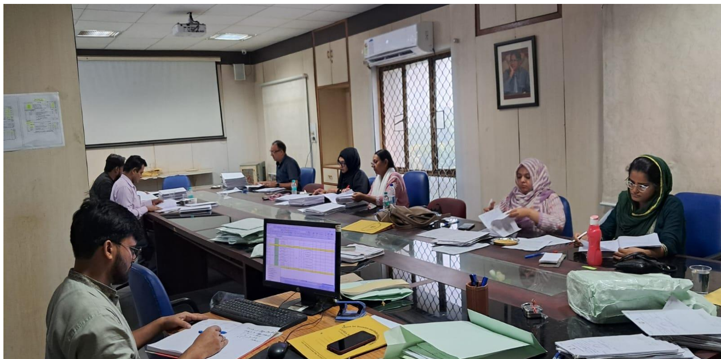
New Initiative of Spot Evaluation of Answer Scripts that helped timely declaration of results