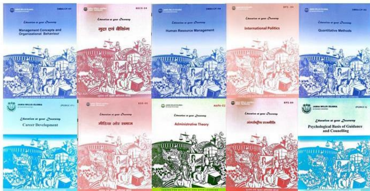
Glimpses of Self-Learning Materials Prepared for Various Programmes