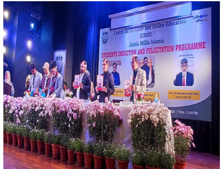
CDOE's magazine was released during Induction Programme